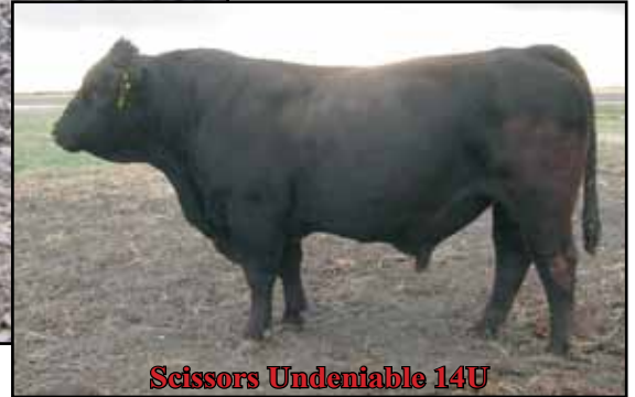
Scissors Undeniable 14U

FOXY CDP BRING IT ON SCISSORS UNDENIABLE 14U BPG703619 MADER PLD BLACKPEARL 61M