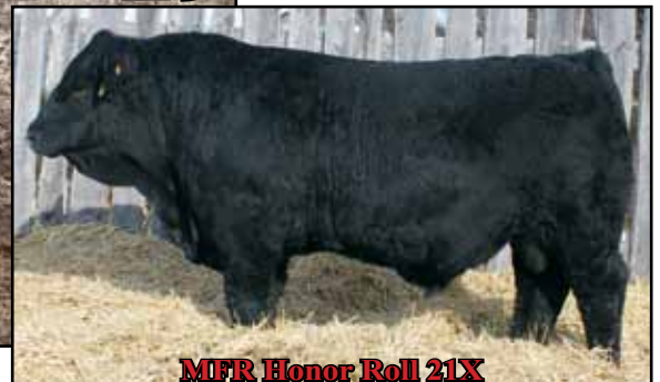
MFR Honor Roll 21X

BH LIMITED BLACK 015K KWA LIMITED 71P BPG628110 BBN MS BLACK FIGURES 14K