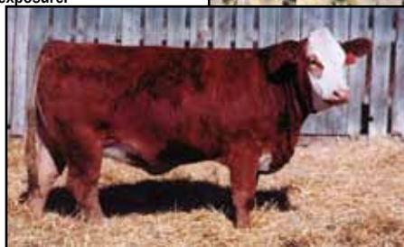
IPU 79S - Maternal sister, Lot 1 in 2007 Simmsational