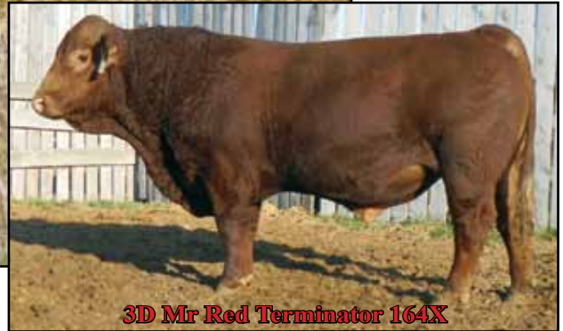
3D Mr Red Terminator 164X

STF MONTANA BLACK KF25 STF LEONA L260 GW STOP LIGHT 024F FHRS 51F'S MS SPECIAL 4H LCHMN BODYBUILDER 7303F BFPS JASMINE 10J MR GJR STYLE 16G LAZY BAR-B ANITA 17F