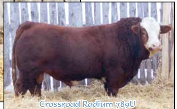
Crossroad Radium 789U

FULL FLECKVIEH FULLBLOOD FEMALE 735056 IPU 135X 29 January 2010