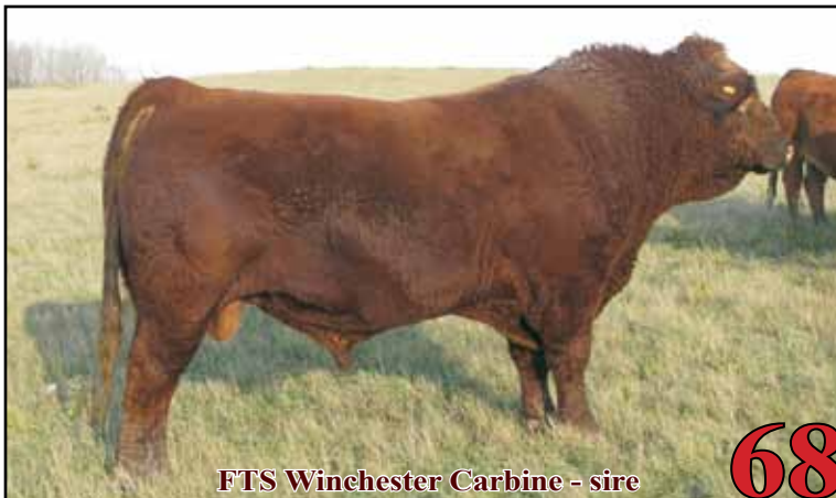
FTS Winchester Carbine - sire

Sale Feature! Heidi Ho is an eye-catching Knock Out daughter out of one of our most consistent females, Rose Hill Licorice, who also sells in this sale. Heidi Ho has the right frame score, bone density, and power to be a factor for many Black programs. Her calf will be the who's who of Black Simmental, so don't miss out on a chance to acquire a front running young lady!