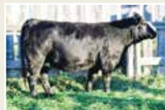
PWK Ms Blk Candy 42Z 19C Dam of Lot 26