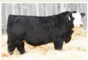
WLB Bull 842D 487G