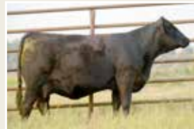
Harvie Crest Black Berry 248D WLB Stockman 420B Daughter Owned by Wilson Stock Farms