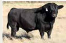
MRL El Tigre 52Z Maternal Grand Sire for Lots 1, 2, 3, 5, 22, 23, 25 & 29