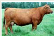
NUG Molly 86Y Maternal Granddam to Lot 52