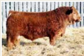
WLB Big Easy 8A 385E Maternal Brother to Lot 40 Owned by Triple T Diamond