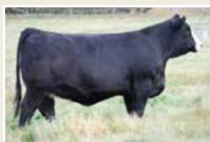
WLB 323B Rita 361F Maternal Sister To Dams of Lots 1, 2 & 3 High Seller in the WLB Top Cut Female Sale To Wilson Stock Farm