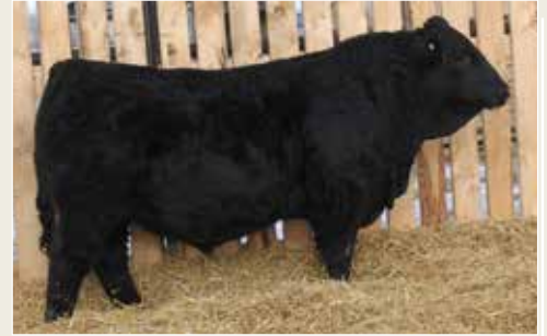
Skors High Roller 34C