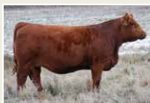
WLB 18D Sofie 493F Sister to Lot 1 Sold in WLB Top Cut Female Sale To Southam Simmentals