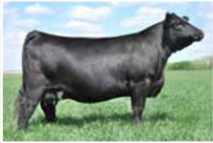
RF Flirtin For Certin 37U Dam of Lot 13 & 14