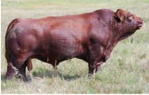
LFE Blockbuster 3011C