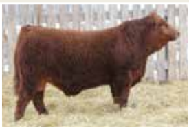
Mar Mac Utah Whisky 52E Sire to Lot 43 - 51