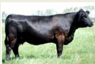
WLB 52Z Tara 3612D Dam of Lot 1

We've watched 493G's development and his approach to maturity and have come to appreciate what he stands for as well as what he brings to the table when thinking about of bull we want to breed our cows to. We know his genetics as well as anyone so you can bet the farm that he will be in our breeding plans this spring. WLB reserves the right to collect 100 units of semen for our in herd use.