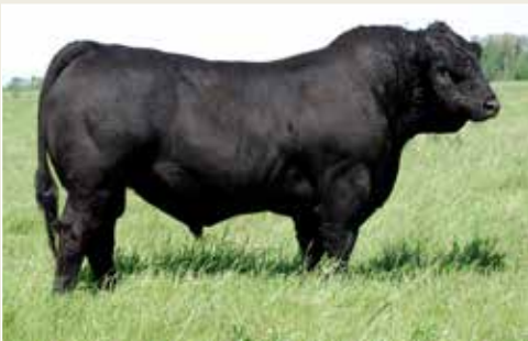
SFM Stoughton 18D