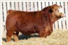
WLB Bull 47Y 356A Full Brother to The Dam of Lot 38 Owned by M&J Farms