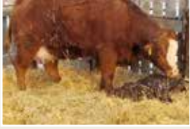
WLB 47Y Fae 343E Lot 43 at Birth