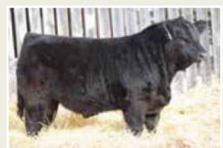
WLB Bull 842D 381G