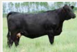
WLB 323B Rita 367D Maternal Sister to Lot 41