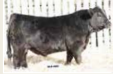
WLB Bull 223W 400Y Maternal Brother of Lot 7 Owned by Muirhead Cattle Co