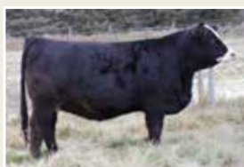
WLB 323B Rita 490F

Maternal Brother to Dams of Lots 1, 2 & 3 Owned By Ferme Gagnon