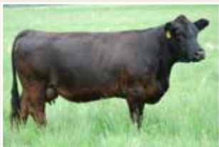
WLB 52Z Tara 3612C

Dam of Lot 2 & Flush Sister To Dams of Lot 1 & 3