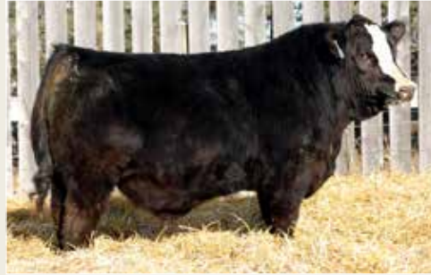
WLB Blaze On 365C 361E