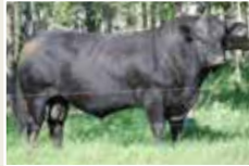
WLB Blowout 381T Maternal Grand sire of Lot 8 WLB Foundation Sire