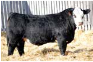
WLB Bull 323B 704D Maternal Brother to Lot 23 Dam