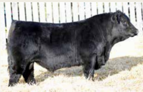
WLB Go Daddy 52Z 368D