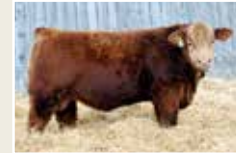
WLB Bull 462P 457C Maternal Brother to Lot 51 Dam Owned by Eric Whitfield