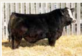
WLB Blaze On 361E

Maternal Brother to Dams of Lots 1, 2 & 3 Owned By Ferme Gagnon