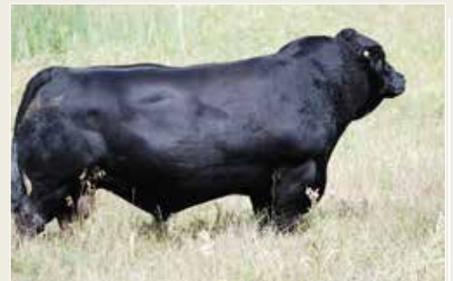
WLB Bounty Hunter 365C