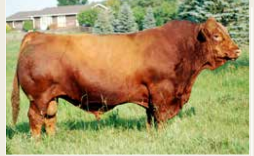
Erixon Game On 42Z