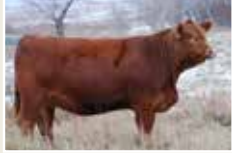
WLB 24C Westlyn 457F Maternal Sister to Lot 51 Dam Sold in WLB Top Cut Female Sale To Evergreen Farms