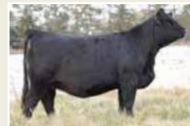
WLB 323B Rita 367F Maternal Sister to Lot 41 Sold in WLB Top Cut Female Sale To Patrick Johnson