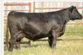
Harvie Crest Mia 188D WLB Stockman 420B Daughter Owned by Wilson Stock Farms

SIRE WLB BOUNTY HUNTER 365C WLB BLAZE ON 365C 361E JFRS MS 43Y