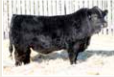
WLB Bull 365C 313F Brother to Lot 17 Owned by Lacombe Research Centre