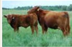
WLB 47Y Fae 433D Maternal Sister to Lot 50 Dam