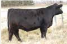
WLB 18D Sofie 311F Maternal Sister to Lot 18 Sold in WLB Top Cut Female Sale To Tiffany Peters