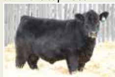
WLB Remarkable 337F