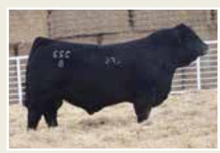
LFE The Riddler 323B Sire of Lot 56