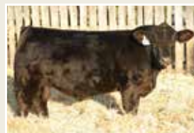
WLB Obsidian Black 391Y Maternal Brother to Lot 16 Dam Owned by Double Bar D Farms

SIRE WLB BOUNTY HUNTER 365C WLB BLAZE ON 365C 361E JFRS MS 43Y