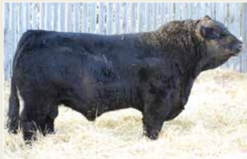
LFE Rig 842D