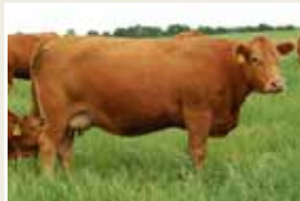
WLB 756T Tressie 424B Maternal Granddam to Lot 44