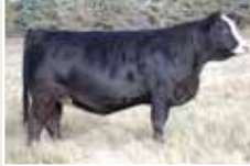
WLB 34C Heidi 381F381F Maternal Sister to Lot 28 Sold in WLB Top Cut Female Sale Owned by Far L Farms