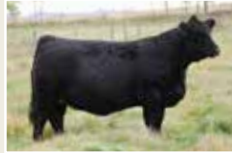
WLB 34C Heidi 380F Maternal Sister To Lot 4 Sold in WLB Top Cut Female Sale to Horner Cattle Company