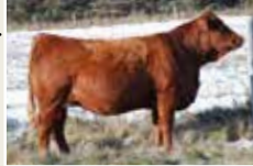
WLB 368D Della 389F Maternal sister to Lot 53 Sold in WLB Top Cut Female Sale To Southam Farms