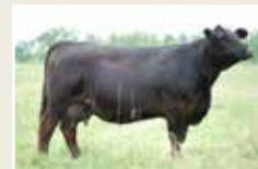
MJ Black Ellie May 30R Maternal Granddam of Lot 20