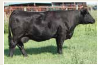
LFE Heaven Sent 30X Dam of Lot 56

Opportunity knocks! Our decision to catalogue Rig wasn't made lightly and sale day isn't here yet. When you see his sons you will appreciate the length of body and muscle mass Rig puts in his progeny. He definitely adds pay weight to a weaned calf crop. His calves are born long bodied and have the vigor that drives them to get up fast and go find their first milk. His pedigree is among the elite being sired by Riddler and out of Lewis' Heaven Sent 30X cow. A Lot of herd bulls could take a lesson from this guy. Rig's breeding prowess is second to none. He loves his job and covers his cows easily, never getting hung up on one cow - he loves them all. With the Riddler influence we have and now Rig's upcoming daughters we feel now is the right time to make him available to the industry, commercial or purebred. We will retain semen for our in herd use.