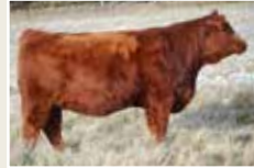
WLB 42Z Gailyn 470F Maternal Sister To Lot 10 Sold in WLB Top Cut Female Sale To Triple R Simmentals