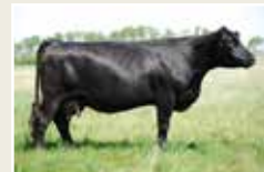
WLB 366R Olive 365T Maternal Granddam To Lot 11