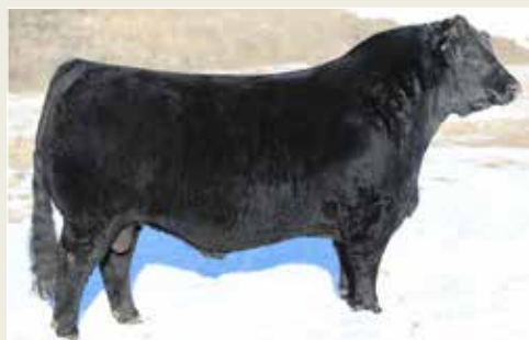
NGDB Structure 34D