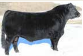
NGDB Structure 34D Sire of Lot 13 & 14