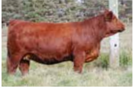
WLB 411F Maternal Sister to Lot 48 Dam Sold in WLB Top Cut Female Sale To Perkin Land & Cattle Co