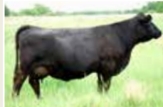
WLB 156S Belle 3554W Maternal Granddam to Lot 18