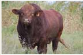
LFE Blockbuster 3011C Sire of Lots 34 -42