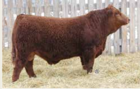
Mar Mac Utah Whisky 52E