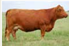
WLB 29A Rocket Girl 423C Dam of Lot 54