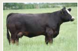
WLB 359A Shea 361C Maternal Sister To Dam of Lots 1, 2 & 3