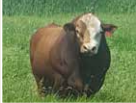
Sunny Valley Force 47Y Maternal Grand sire of Lot 43 & 45 WLB Foundation Sire