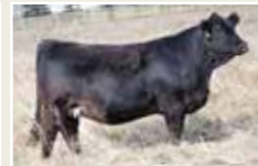
WLB 4161D Nora 451F Maternal Sister to Lot 21 Sold in WLB Top Cut Female Sale To Patrick Johnson