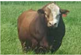
Sunny Valley Force 47Y Maternal Grand sire of Lots 34 - 38