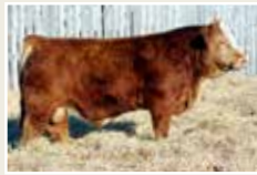
WLB 441C Maternal Brotherr of Lot 37 Owned by Matt Austin