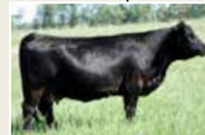
WLB 223W Gwen 404Z Dam of Lot 21