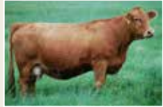
WILC Queenie 6A Maternal Granddam of Lot 45