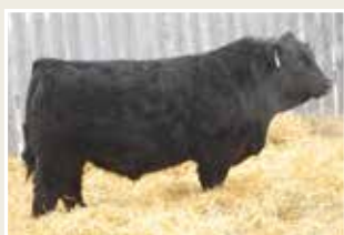
WLB Bull 842D 484G Lot 24 Son of