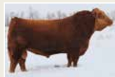
Erixon Game On 42Z Sire of Lots 52 - 55