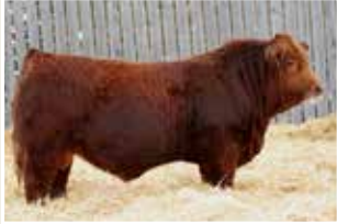
WLB Blood Runner 461F Full Brother to Lot 34 Owned by Kline Simmentals