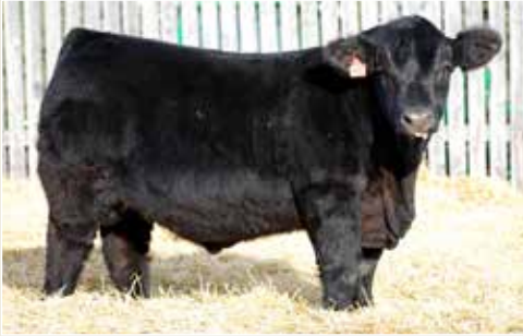
WLB Big Northern 52Z 4161D