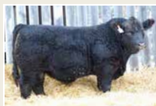
WLB Bull 842D 302G