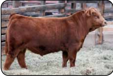
Rust Henn Rambler 6003 Hart State of War 056C