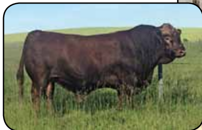
OVHF Tribute 138E