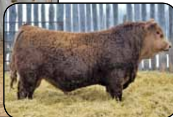
PWK Red Bourbon 87Y 25D