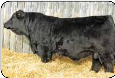
LFE BOUNTY 3118Z WLB BOUNTY HUNTER 365C LFE BS MARY 26A