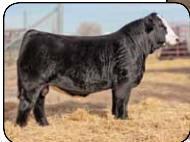
Double Bar D Annuity 635F