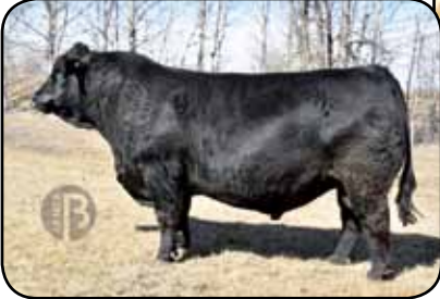
LFE BOUNTY 3118Z WLB BOUNTY HUNTER 365C LFE BS MARY 26A