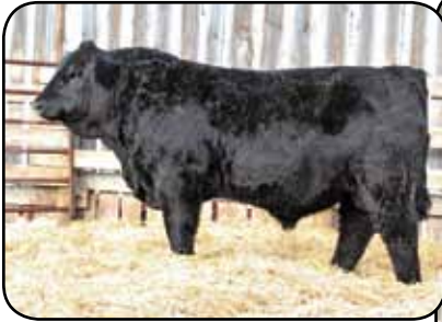
DEEG Empire 63Z WLB Bounty Hunter 365C