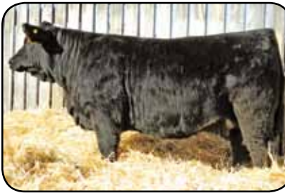
maternal sister LTS Crocus Pandora 15F brother to dam