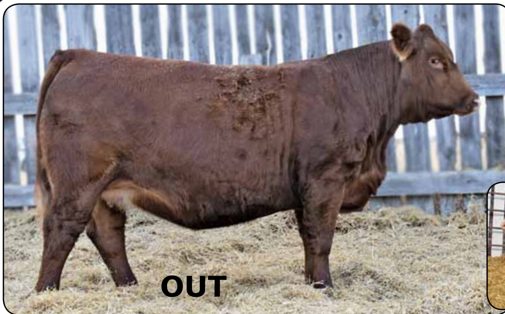
Little Perks Big Red 3721G