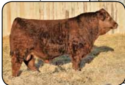
Boundary Strut 155G