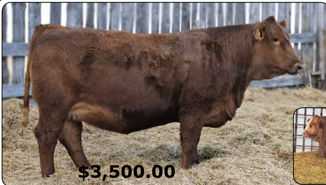
Little Perks Big Red 3721G