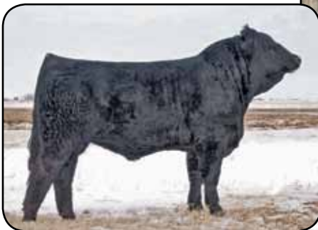
S-Paw Blk Uproar 21U

S-PAW BLK SHOW OFF 5S S-PAW BLK UPROAR 21U S-PAW RED RAZZAMATAZZ 156