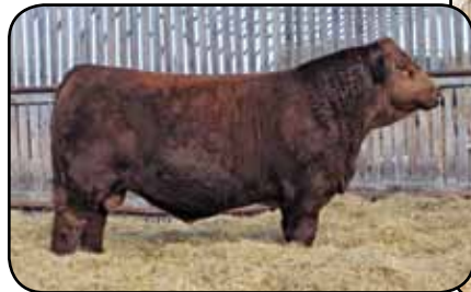
Black Gold Approval 71E

IPU RED DEPUTY 25C IPU LIEUTENANT 24E IPU MS. HORIZON 21A