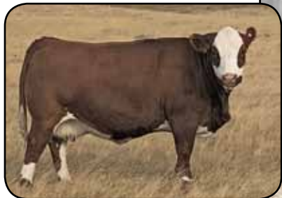
BEE Lila 452B