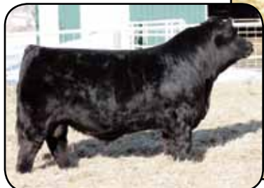
Wheatland Bentley 630D

WHEATLAND FINAL AFFAIR WHEATLAND BENTLEY 630D WHEATLAND LADY 72X