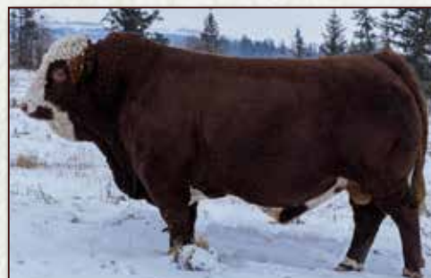
JNR BERETTA - SON OF JNR BOULDER