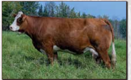
JNR ANIKA 962G - DAM OF LOT 10

JNR BOULDER JNR PROXY JNR POLLED PAMELINA