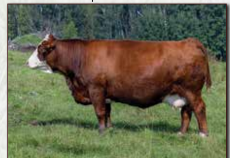
JNR APPOLLO MARTINA - MATERNAL GRANDDAM OF LOT 52

JNR'S SLATE OLE LOLITA 177Z KUZ MR APPOLLO 11X JNR'S RESERVE MARTINA