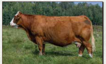
JNR PETRA 819E - DAM OF LOT 7

JNR BOULDER JNR PROXY JNR POLLED PAMELINA