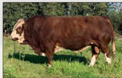
JNR ARMOR - SIRE OF LOT 39-41 GRANDSIRE OF LOT 15,62 & 63

JNR BALDWIN JNR TORQUE JNR MARTINA 452A JNR ARMOR JNR POLLED MARITA 1101J JNR MARITA