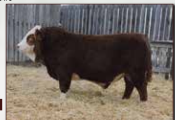
JNR BARBARIAN - SIRE OF LOTS 1 - 6 & 58