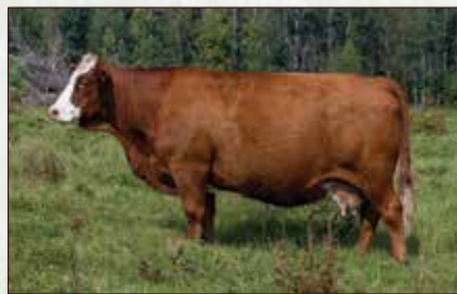
JNR MALITA 622C - GRANDDAM OF LOT 47

CE 12.8 BW 1.5 WW 52.7 YW 67.8 M 30.9 MCE 7.8 MWW 57.3