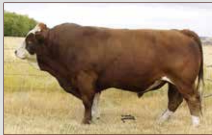
PRAIRIE ROSE MONET - SIRE OF LOT 44 AND 45

CE 2.9 BW 4.2 WW 78.8 YW 104.3 M 25.4 MCE 1.5 MWW 64.8