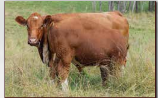
KSL JEWEL 66J WITH LOT 25 AT SIDE