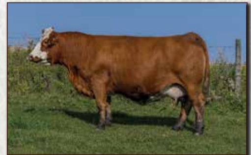
JNR POL PAMELINA - MATERNAL SISTER TO JNR PROXY & DAM OF LOT 4

SHAWACRES JAHARI 50L MFI LOLITA 3107 JNR'S POLLED CRACKERJACK JNR'S PAMELINA