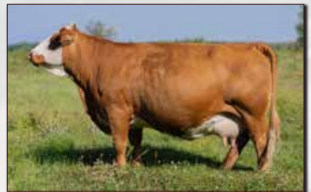
JNR MARTINA 560C - PATERNAL GRANDDAM OF LOT 19-23 &amp; 64