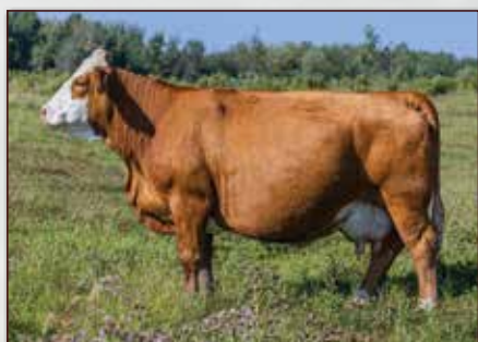
JNR MARTINA 452A