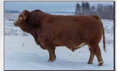
KSL PLD HONYTONK 126H - SIRE OF LOTS 46 - 51

CE 15.2 BW 1.4 WW 62.7 YW 78.6 M 33.3 MCE 8.5 MWW 64.7