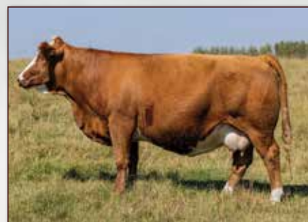
JNR PETRA 544C