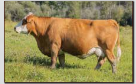
JNR POL PEARL - DAM OF LOT 60

CE 2.9 BW 5.2 WW 76.8 YW 108.2 M 33.8 MCE 3.9 MWW 72.2