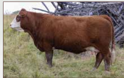
JNR GRACEFUL 61H - DAM OF LOT 34

CE 2.6 BW 5.7 WW 77.8 YW 107.9 M 33.7 MCE 2.3 MWW 72.6