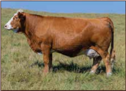
JNR JUNO 750E