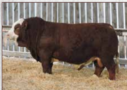
JNR BALDWIN - SON OF JNR BOULDER