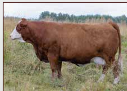
JNR'S GRACEFUL 613C