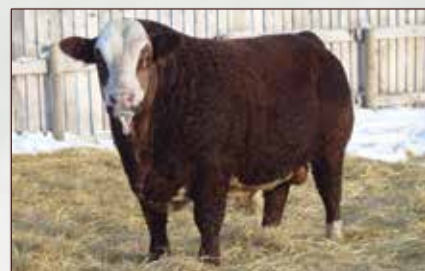
BRINK BULLET PROOF A342 - GRANDSIRE OF LOT 40

CE 0.8 BW 7.4 WW 73.9 YW 99.7 M 26.8 MCE -0.7 MWW 63.8