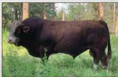
JNR SLATE - SON OF MFI BAM BAM