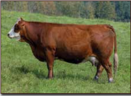
JNR HANNA 991G