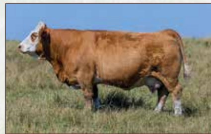
OLE LOLITA 177Z - DAM OF JNR STONE MATERNAL GRANDDAM OF LOTS 20,22,32 & 41

CE -1.1 BW 8.8 WW 74.3 YW 100.1 M 29.8 MCE -2.5 MWW 67.0