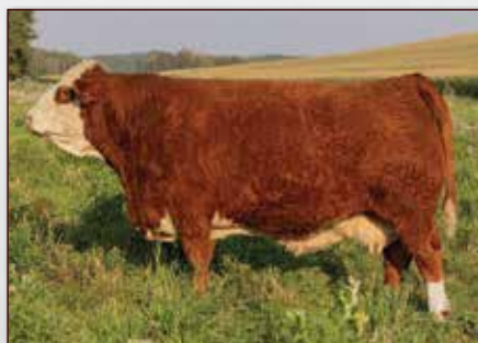
JNR'S GRACEFUL 141Y