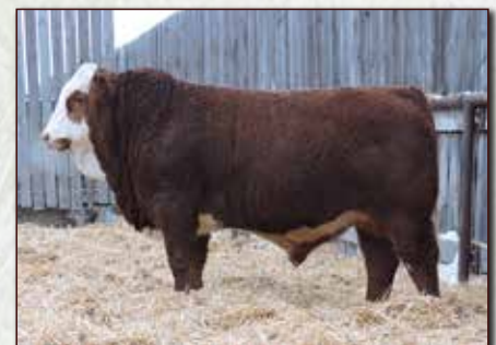
JNR HIGHLIGHT - SIRE OF LOTS 19-23 & 64

JNR'S CONCEPT JNR SHELAIN JNR'S SALTON JNR SHAMU