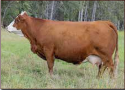
LONE STONE SHELLY 44H