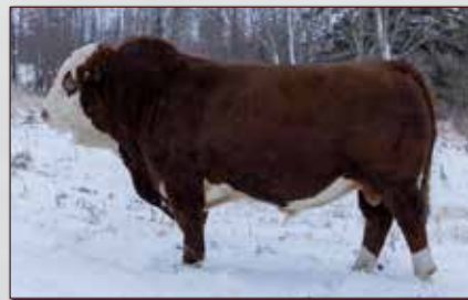
BLL FOREMAN 126J - SIRE OF LOT 36, 37 &amp; 65

CE 1.6 BW 7.2 WW 75.6 YW 102.2 M 33.4 MCE 2.4 MWW 71.2