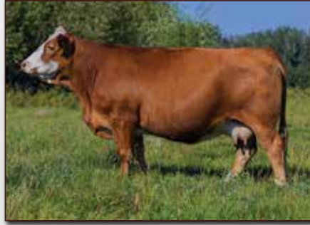
JNR SIENNA 8113F