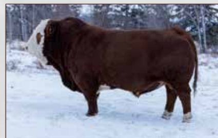
JNR PROXY - SIRE OF LOT 7-12 & 66-67 GRANDSIRE OF LOT 47 & 53

CE 0.8 BW 8.5 WW 92.9 YW 126.6 M 27.5 MCE 0.3 MWW 74.0