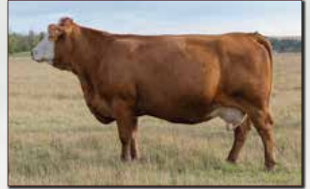
JNR HELLINA 974G - DAM OF LOT 23