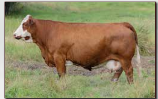
DORA LEE'S VICKY FF4E - DAM OF LOT 3

DDD BROADWAY G534 PORTERS 16T KING ARTHUR DORA LEE'S SOPHIE FF5W