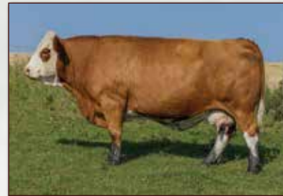
JNR MYSTIC 229Z - DAM OF LOT 58 & DAM OF JNR ARMOR

JNR BALDWIN JNR BARBARIAN RUK MS CAPRI 1C