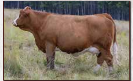
JNR POL MARGARITA 817E - DAM OF LOT 44

1470163 | JNR 411L | Dec 20, 2023 | Fullblood