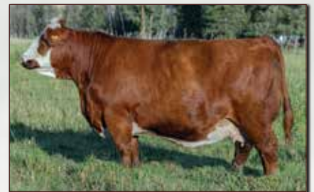
RUK MS CAPRI 1C - GRANDDAM OF LOT 6

JNR BALDWIN JNR BARBARIAN RUK MS CAPRI 1C