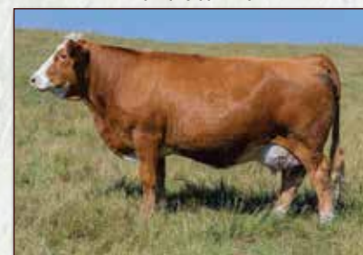
JNR JUNO - DAM OF LOT 2 PATERNAL SISTER OF LOT 42