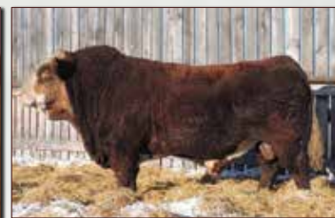
JNR BOULDER - SON OF MFI BAM BAM