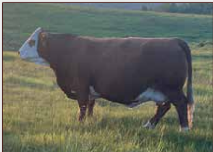
JNR GRACEFUL 410A