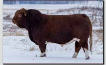
JNR QUEST - SIRE OF LOTS 52 AND 53

CE 12.6 BW 0.8 WW 67.8 YW 89.2 M 27.9 MCE 6.2 MWW 61.8