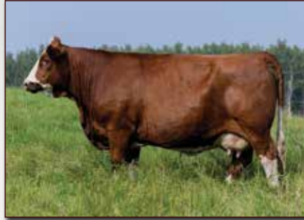
LONE STONE SHELLY 54D