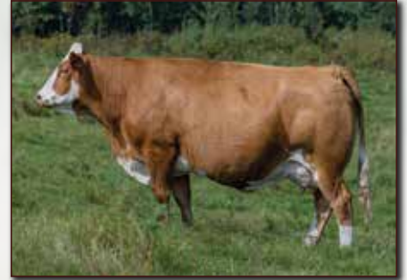
DWAYANN ANIKA 6D