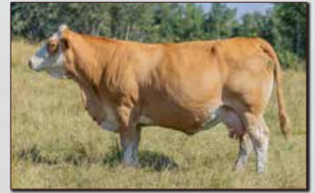
JNR 830A - GRANDDAM OF LOT 48

CE 6.2 BW 4.3 WW 56.9 YW 72.1 M 34.5 MCE 2.4 MWW 63.0