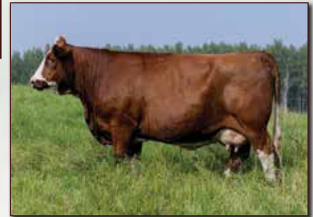
LONE STONE SHELLY 54D MATERNAL GRANDDAM OF LOT 51

MFI BAMBAM JNR SHAMU BLCC MR JUGGERNAUT 371A BIG SKY SHELLY