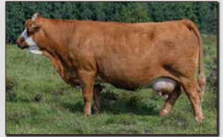
JNR LOLITA 764E - DAM OF LOT 22