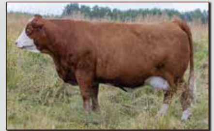
JNR'S GRACEFUL 613C - DAM OF LOT 5 GRANDDAM OF LOT 1 & 53

JNR BALDWIN JNR BARBARIAN RUK MS CAPRI 1C