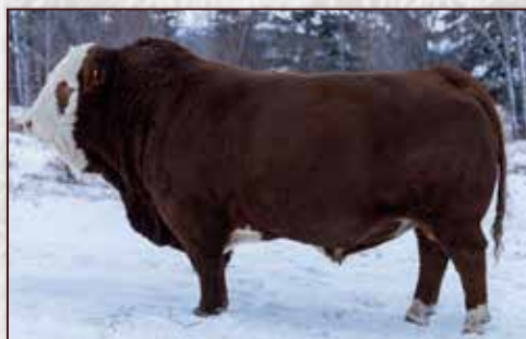
JNR PROXY - SON OF JNR BOULDER

SIM-ROC C&B WESTERN ADRIAN MFL HAXAN 29X KNIGHT SHAMU 163T