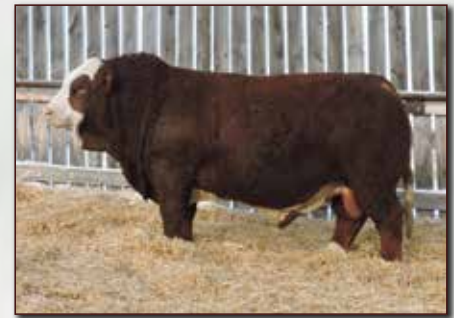
JNR BALDWIN - SIRE OF LOT 29 -31 & 63 GRANDSIRE OF LOT 1-6, 14-18,55,58 & 62

BRINK BULLET PROOF A342 JNR MYSTIC 229Z JNR STEELE 248Z JNR GRELLIETA 660D