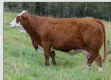
JNR GRACEFUL IMAGE 802E DAM OF LOT 1

CE 8.3 BW 3.3 WW 84.5 YW 110.5 M 33.1 MCE 7.0 MWW 75.4