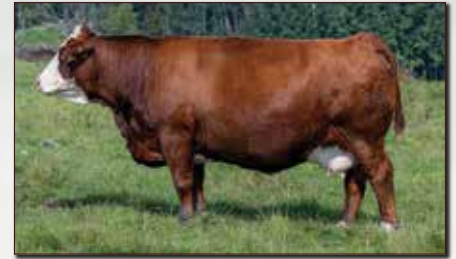
JNR STONE - SIRE OF LOT 24-28 GRANDSIRE OF LOT 52