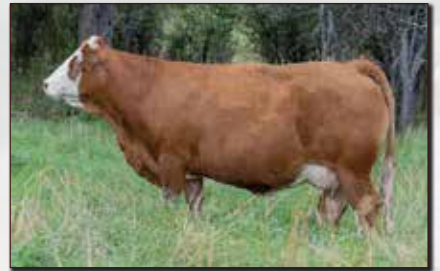
JNR PETRA 130H - DAM OF LOT 9

JNR BOULDER JNR PROXY JNR POLLED PAMELINA