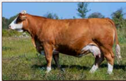
JNR HELGA 572C - DAM OF LOT 16

JNR BALDWIN JNR TORQUE JNR MARTINA 452A GGT WILLY JOE 64Y JNR HELGA 572C MFI HELGA 8083