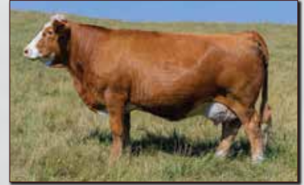
JNR JUNO - MATERNAL SISTER OF LOT 42

T1470866 | JNR 453M | Jan 01, 2024 | Fullblood