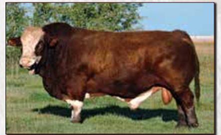
MFI BAM BAM - MATERNAL GRANDSIRE LOT 62

CE 3.2 BW 4.8 WW 73.4 YW 95.7 M 27.0 MCE 3.4 MWW 63.7