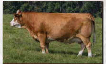
JNR HANNA 5104C - GRANDDAM OF LOT 50 &amp; 61

CE 10.4 BW 3.6 WW 63.7 YW 83.1 M 31.4 MCE 6.7 MWW 63.3