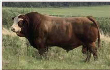
JNR'S CONCEPT - SIRE OF LOT 13 GRANDSIRE OF LOT 18,23,34,38,45,54 & 64

CE 0.4 BW 8.3 WW 77.3 YW 104.6 M 31.7 MCE 1.0 MWW 70.4