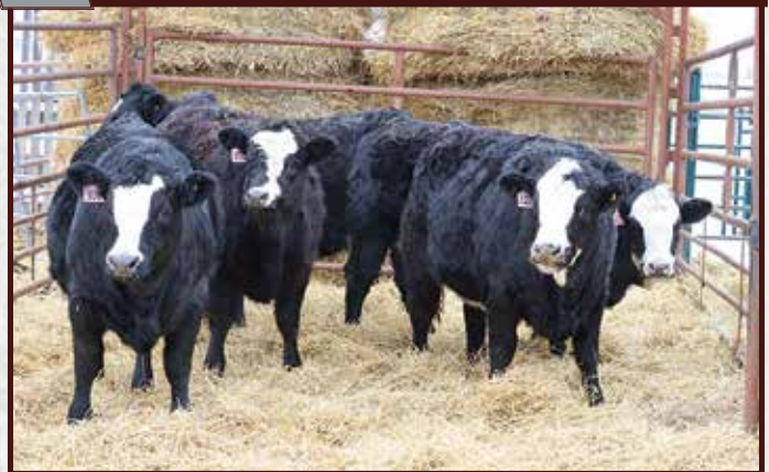
5 Black Heifers