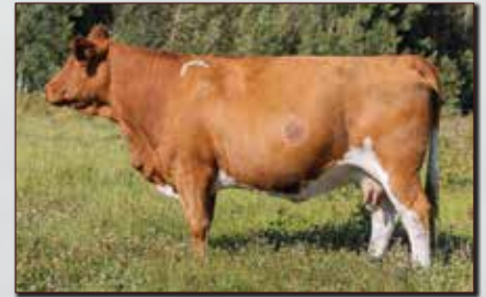
JNR SIENNA 645D - DAM OF LOT 30