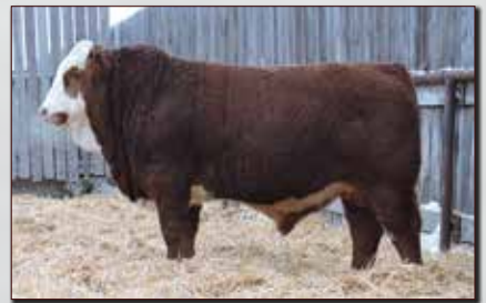
JNR HIGHLIGHT - SIRE OF LOT 19-23 &amp; 64