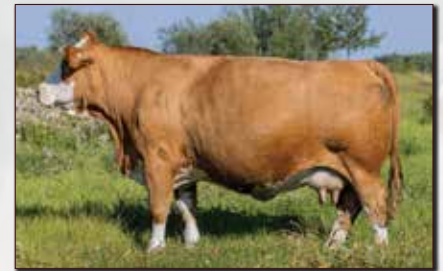
JNR MARGO 583C - DAM OF LOT 31