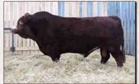
JNR STEELE 248Z - SIRE OF LOT 55 GRANDSIRE OF LOT 21, 39-41 & 63

CE 6.4 BW 5.6 WW 69.6 YW 90.6 M 31.2 MCE 2.7 MWW 66.0