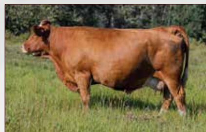
BIG SKY PANDA 9E - DAM OF LOT 37 GRANDAM OF LOT 13

CE -0.3 BW 9.1 WW 77.4 YW 105.3 M 38.5 MCE 0.0 MWW 77.2