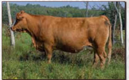
JNR MISS KNIGHT - DAM OF LOT 21