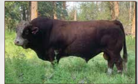
JNR'S SLATE -SIRE OF LOT 43 GRANDSIRE OF LOT 10,20 & 24-28

P1470877 | JNR 466M | Jan 03, 2024 | Polled Fullblood