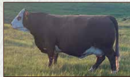
JNR GRACEFUL 410A - DAM OF LOT 59 GRAND DAM OF LOT 5, 45 & 34 GREAT GRAND DAM OF LOT 1 & 53