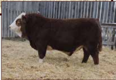
JNR BARBARIAN - SIRE OF LOTS 1 - 6 & 58