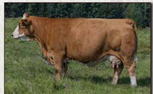
JNR TAJSA 712D - GRANDDAM OF LOT 26