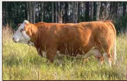
WOLFES MARITA FF 19Z - DAM OF LOT 35 GREAT GRAND DAM OF LOT 15

CE 1.7 BW 6.9 WW 85.9 YW 121.6 M 33.9 MCE 3.0 MWW 76.9