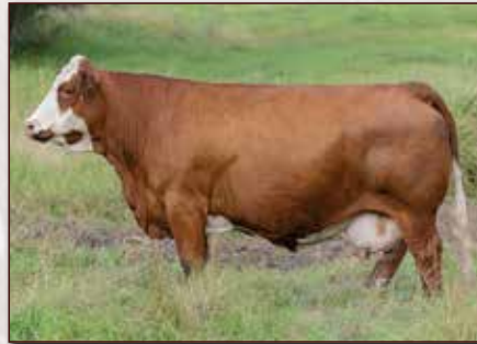
DORA LEE'S VICKY FF4E