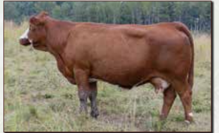
ANCHOR D TAE 248F - DAM OF LOT 24