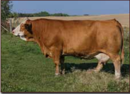
JNR SIENNA 534C