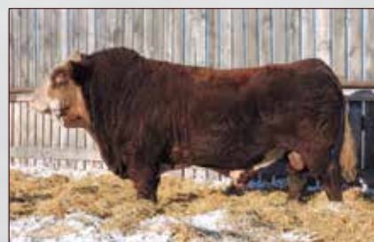
JNR BOULDER - MATERNAL GRANDSIRE OF LOT 14

JNR BALDWIN JNR TORQUE JNR MARTINA 452A JNR BOULDER JNR PETRA 9110G JNR PETRA 742E