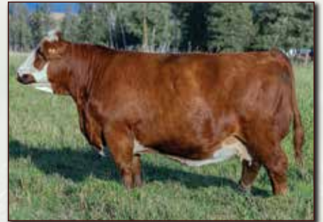
RUK MS CAPRI 1C