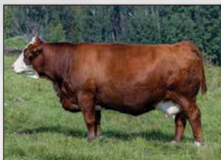
JNR APPOLLO MARTINA 315Z