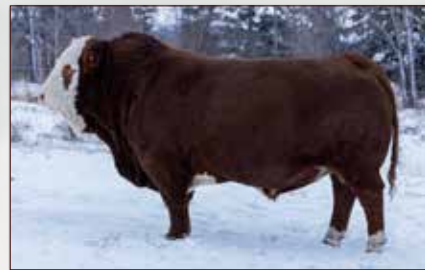
JNR PROXY - SIRE OF LOT 7-12 & 66-67 GRANDSIRE OF LOT 47 & 53

CE 5.2 BW 6.3 WW 82.5 YW 113.5 M 31.0 MCE 1.9 MWW 72.3