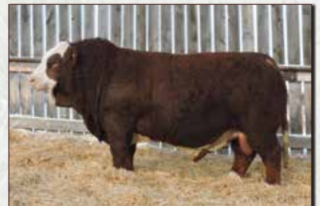
JNR BALDWIN - SIRE OF LOT 29 - 31 & 63 GRANDSIRE OF LOT 1-6, 14-18,55,58 & 62