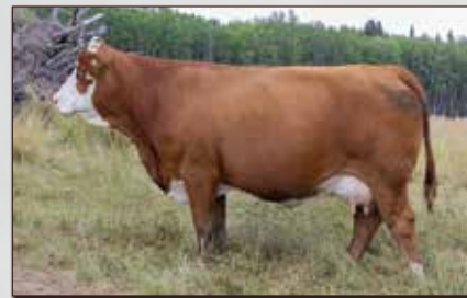
JNR SIENNA 177J - DAM OF LOT 39

CE 1.8 BW 6.7 WW 67.1 YW 92.8 M 26.2 MCE -1.3 MWW 59.8