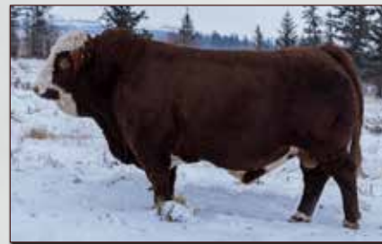
JNR BERETTA - SIRE OF LOTS 32 - 35 &amp; 59-60

CE 2.5 BW 6.2 WW 82.1 YW 116.6 M 36.5 MCE 0.9 MWW 77.6