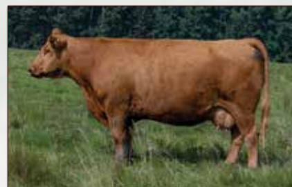
JNR CORALEE 729E - DAM OF LOT 46

CE 14.4 BW 0.2 WW 57.9 YW 77.2 M 33.9 MCE 7.2 MWW 62.9