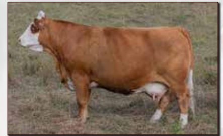
JNR HANNA 827E - DAM OF LOT 61

CE -0.1 BW 7.7 WW 84.5 YW 111.8 M 28.4 MCE 1.0 MWW 70.7