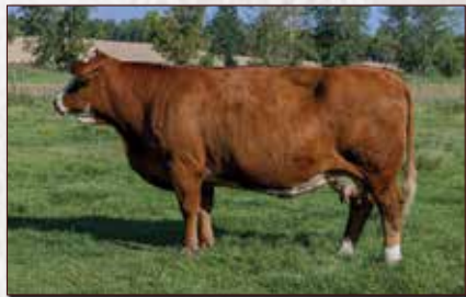
JNR OLE' LOLITTA 710D - DAM OF LOT 67

CE 1.9 BW 7.2 WW 85.4 YW 118.1 M 31.0 MCE 0.6 MWW 73.7