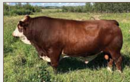
JNR SNIPER - MATERNAL BROTHER OF LOT 12 & GRAND SIRE OF LOT 65

CE 2.9 BW 6.6 WW 79.8 YW 110.6 M 34.6 MCE 0.6 MWW 74.5