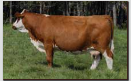
JNR MALITA 831F - DAM OF LOT 8 FULL SIB TO JNR SNIPER

JNR BOULDER JNR PROXY JNR POLLED PAMELINA