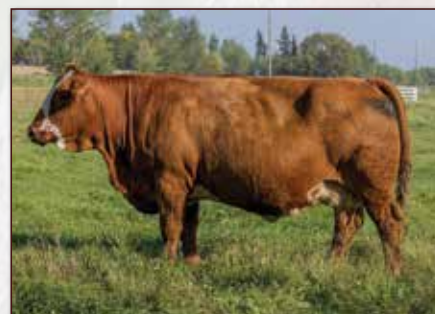
JNR PETRA 853F