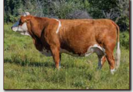
JNR SHAMU 918F