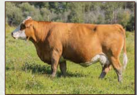
JNR POL PEARL 487B