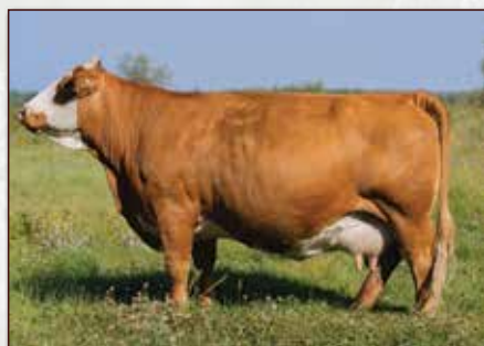
JNR MARTINA 560C