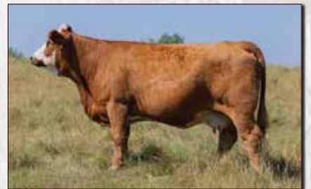
JNR LOLITA 810E - DAM OF LOT 32