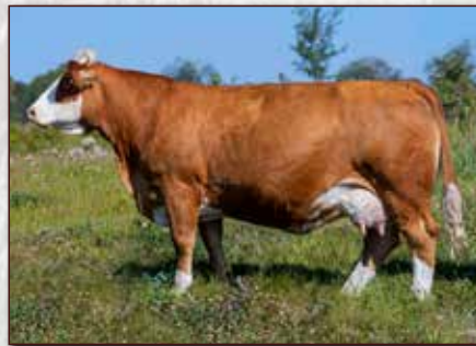
JNR HEGA 572C