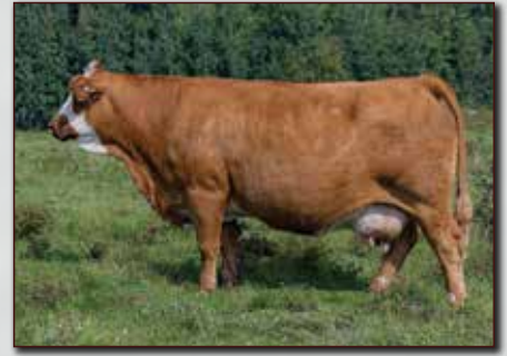
JNR LOLITA 764E