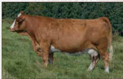
JNR SIENNA 762E - DAM OF LOT 38

CE -1.1 BW 9.0 WW 86.0 YW 112.9 M 35.4 MCE 1.4 MWW 78.4