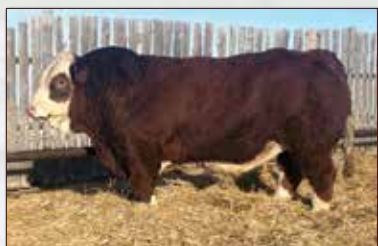
JNR BAILIFF - SON OF MFI BAM BAM

GREAT GUNS FREDERICK 48B MISS KNIGHT 155S BALU ANCHOR "T" EMMY 5B