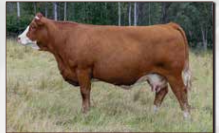
JNR RHEA 886F - GRANDDAM OF LOT 54

CE 3.0 BW 5.6 WW 69.0 YW 84.9 M 30.4 MCE 3.2 MWW 64.9