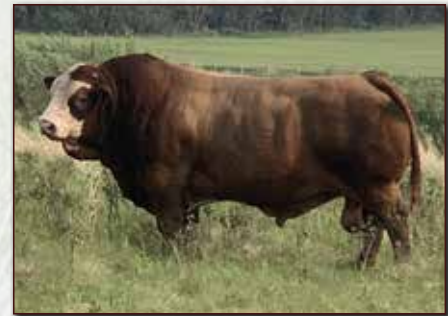
JNR'S CONCEPT - SIRE OF LOT 13 GRANDSIRE OF LOT 18,23,34,38,45,54 & 64

BRINK BULLET PROOF A342 JNR POLLED ELLEN 306Z MFI BAMBAM MFI MALITA 8114