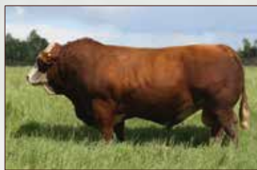
JNR BROKER - SON OF MFI BAM BAM