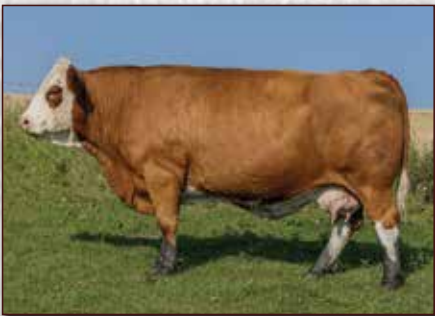
JNR MYSTIC 229Z