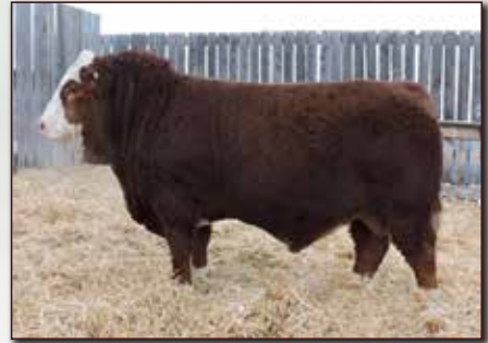
JNR TORQUE - SIRE OF LOT 14-18 & 62

JNR'S CONCEPT JNR SHELAIN WOLFES TITAN FF 51T LONE STONE MS ADONIS 21T