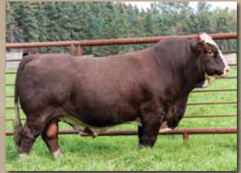
MJB HADRIAN 39H Sire of Lots 22, 51 and 58

PERF BW 92 AWW 822 | EPD's CE 4.8 BW 4.9 WW 77.3 YW 103.4 Milk 34.1 MCE -0.3 MWW 72.8