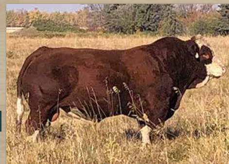
SPRUCEBURN FULL MOON 48F Sire of Lots 10 and 11

Cherry Red with big goggles, this bull is an eye catcher among his peers. This is Miss Mitz 6H's second calf, his older sister is working in our herd. This guy is probably one of my favorite 2 year olds. His red is so dark in places it's almost black.