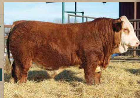
WOLFES KENT FF35K Sire of Lots 44 - 48, 54