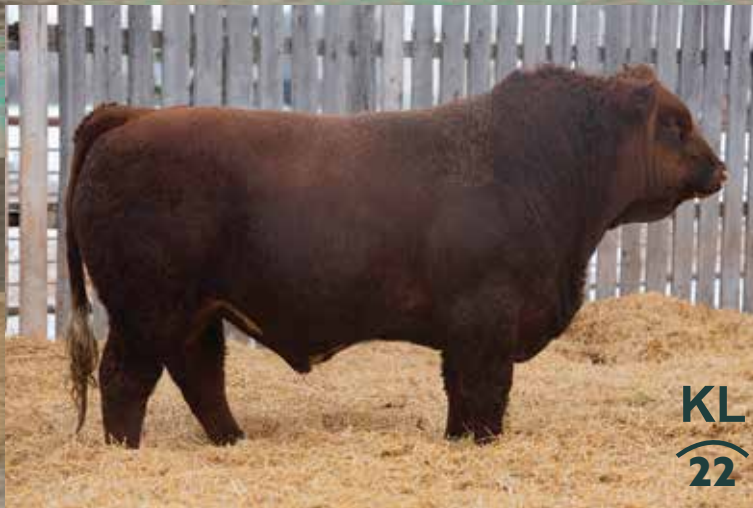
MJB HADRIAN 39H Sire of Lots 22, 51 and 58