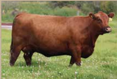
RED GEIS POTEET 45'11 Maternal Granddam of Lot 38

Another bull which can be used on heifers. Note he goes back to the Poteet Cow line. His Dam being a direct daughter of my original Poteet Cow bought at the Geis Dispersal. A tidy, moderate cow that is a pleasure to look at.