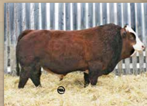
RWR SULLY 9E Sire of Lot 13 - 15 and 50

Off a first calf female. Sully has done a good job on our heifers as they calve so effortlessly. This guy's Dam has a neat, tidy udder and moderate in size.