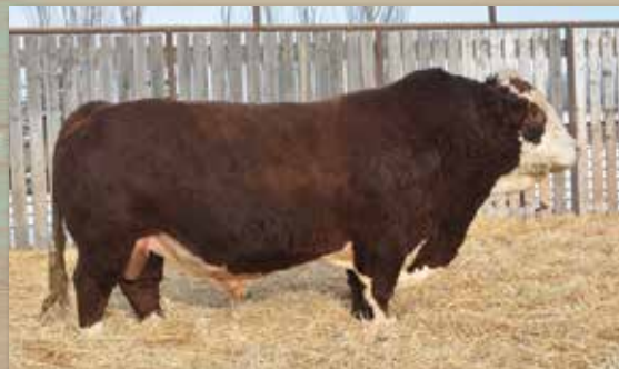
FSS POLLED HENDRIX Sire of Lots 8 and 9