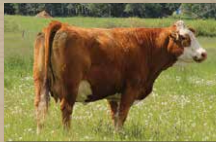
LONE STONE MS STAMPY 19W Granddam of Lot 8