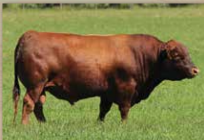
RED HAZEL BLUFF DAKOTA 31G Sire of Lots 37, 40, 41, 42, 85