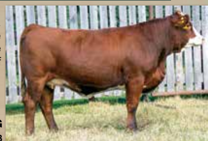
DIAMOND T 136G Dam of Lot 58

100% Fleckvieh. Horned. Lab Pending. DT 136G has been a very good purchase. We've sold 2 bulls in our sale and a female to Ashley Perpelkin. Next heifer I vow we are keeping. Moderate framed cow with lots of milk.