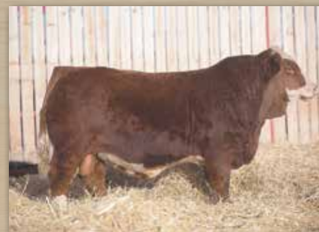
STBS HARRISON 77J - Sire of Lots 1 - 3, 63 - 64

Very moderate statured bull with exceptional thickness. His polled head got lost somewhere in the genes. He sure walks out well for being so stout.