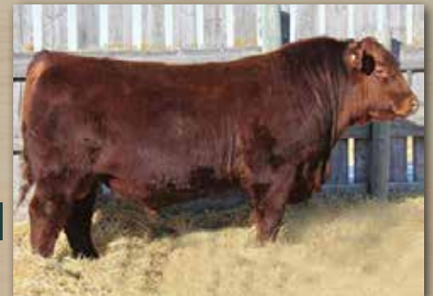
RED DOUBLE C HANDSOME 18H Sire of Lots 28 - 33, 81

This is Biebird 86F's 4th calf. A female was sold to Corn Ranch and 2 bulls sold to Airbro Farms & Harold Galiford. Bar E-L Agent in this guy's pedigree is surely a plus. The females all have tidy bags and good feet. Just love our Agent daughters. A definite cow bull that will add pounds to your calves at weaning.