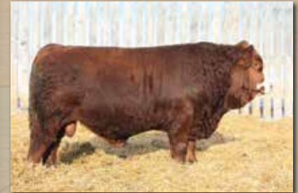
KEETS KINETIC 14K Sire of Lots 60 - 62

A moderate framed bull with lots of width over the top. I've been really happy with the birth weights on all our Kinetic calves. If you need to drop some birth weight in your herd, I would recommend these genetics. Nothing wrong with 700 lb weaning weights from calves raised on grass & milk.