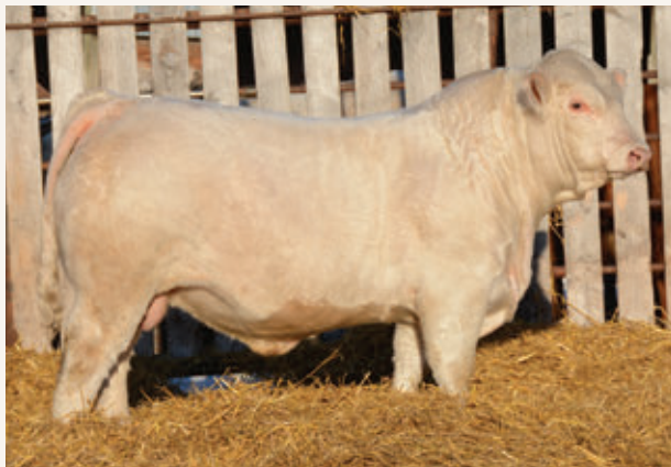
FULL BROTHER HIGH BLUFF 1L

CE 6.9 // BW 1.7 // WW 76 // YW 123 // Milk 24 // MCE 9.6 // MTL 62 // TSI 267.77