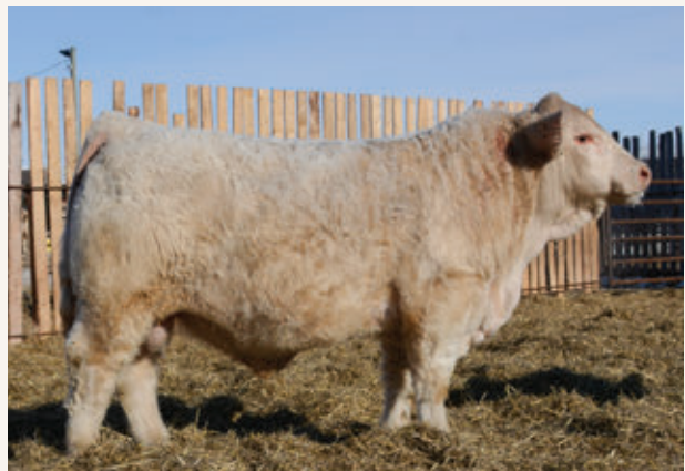
PATERNAL GRANDSIRE HIGH BLUFF GAME ON 78G