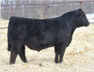
SIRE LCDR FAVOR 149F