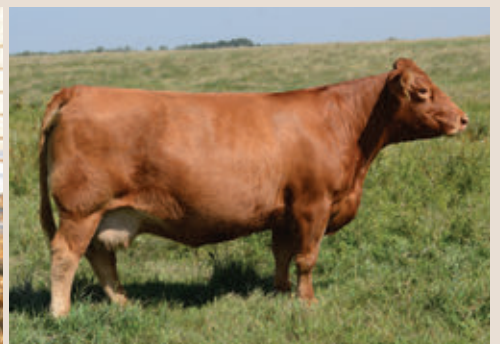
MATERNAL GRANDDAM EGC RED LASHES 77B