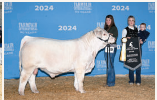
LOT 1 HIGH BLUFF MARKSMAN 21M NATIONAL SENIOR BULL CALF CHAMPION