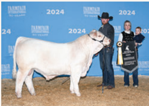
LOT 2 HIGH BLUFF MAIN EVENT 70M NATIONAL INTERMEDIATE BULL CALF CHAMPION

A pedigree that is becoming a staple in the Charolais breed. Keystone was used in our AI program with great results in quality; producing a couple top end heifers in the replacement pen and Main Event. Main Event made a number of friends this past fall on the show road. He has tremendous length, depth of side, athleticism and attractive look. Set Main Event in motion and this guy can really get out and go. The greatest characteristic to Main Event undoubtedly is his dam; Lady Slipper 72F. Not only is 72F a stunning front pasture type female with a near perfect udder, her track record is impeccable. In last year's sale catalog we wrote that we were excited about her Keystone bull calf already. We're excited that she had another Keystone bull calf at side this year, and we're going to cross our fingers for a heifer calf next year. Main Event's maternal brother was one of our high sellers last year to P&H Ranching.