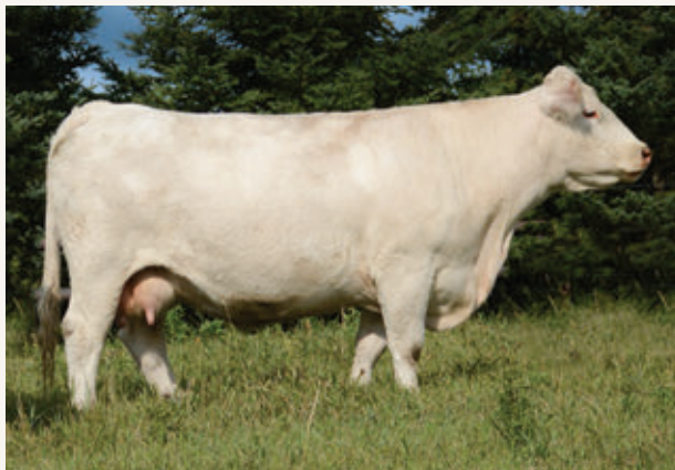
PATERNAL GRANDDAM DRD LEDGER STAR 942D

His dam is a good looking, big bodied, no miss, herd bull building machine. She has sired 5 top end sale bulls in a row for the bull sale and a female that we retained in the herd. Each year the bull calf that she raises comes to the top of the pen in weaning and yearling weights. With Mastermind, you're getting a bull that is built on strong, reliable genetics and the performance to match.