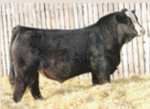
SIRE MADER SON OF ANARCHY

We really appreciate the look and style of the Anarchy cattle, they've got that little extra "look on over here style" that grabs your attention. His dam has clicked well with Anarchy. Last year's full brother went to our friends at M and J Farms. SIRE VERIFIED. HOMO BLACK. HOMO POLLED.