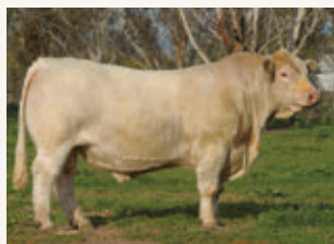
SIRE VENTURON MAXIMUM IMPACT