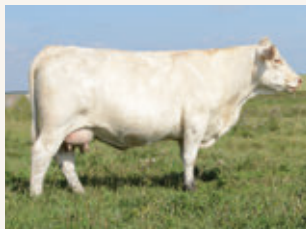
DAM HIGH BLUFF JIVE 138C

CE 3.8 // BW 1.2 // WW 52 // YW 107 // Milk 22 // MCE 8.3 MTL 48 // TSI 256.42