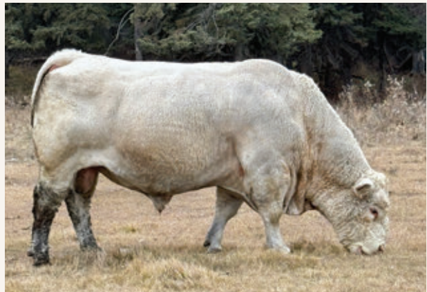
MATERNAL GRANDSIRE KAYR DEPUTY 716G