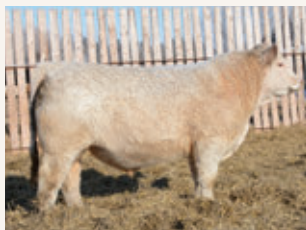
MATERNAL SIRE HIGH BLUFF GRAND DESIGN 58G

CE 7.8 // BW 0.8 // WW 76 // YW 131 // Milk 27 // MCE 7.6 // MTL 65 // TSI 273.92