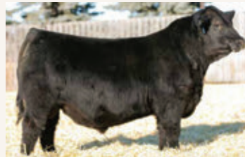
REFERENCE SIRE HF NIGHT MOVES 150H