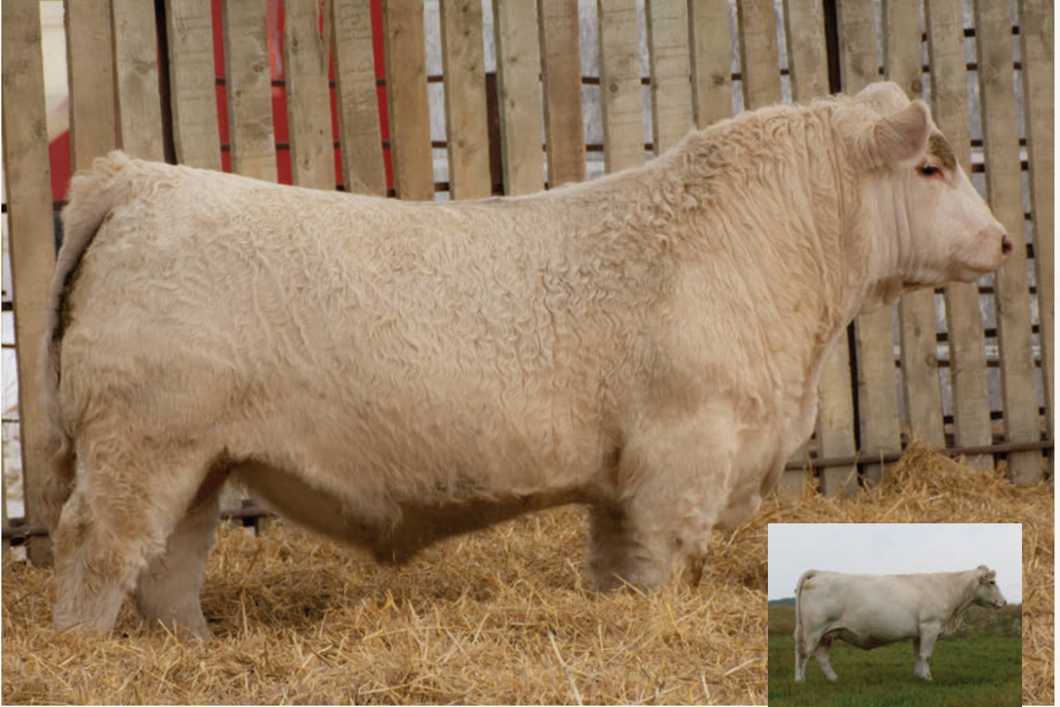
DAM HIGH BLUFF JIVE 83D