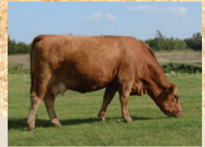
DAM EGC WANDA 11G