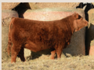
FULL SISTER EGC 75J

CE 8.3 // BW 2.8 // WW 79.4 // YW 119.5 // Milk 18.6 // MCE 2.8 // MWW 58.3 // API 99.92 // TI 65.15