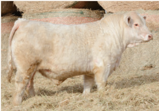
SIRE HIGH BLUFF JJ 85J

Maximus is the real deal with herd bull written all over him. He is explosive in muscle pattern and density yet lays in a tidy smooth shoulder. The JJ x Deputy mating may as well be a match made in heaven cause it flat out works and produces some great results. A JJ x Deputy female might be our favourite female in the replacement pen. The Paris cow family is among the elite, producing greats like Crowd Favourite, Bulletproof and Limitless. Maximus is a bull that we feel could really go out and do some exceptional things.