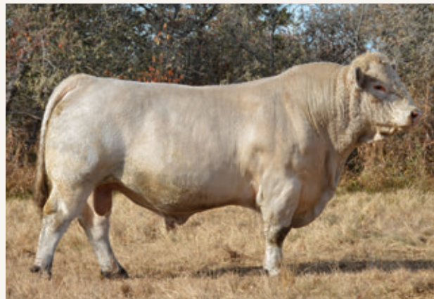
MATERNAL GRANDSIRE TRIUMPH 50B