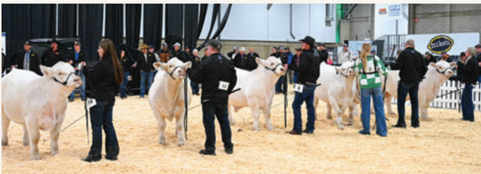
PLAYERS CLUB JACKPOT FINAL DRIVE 3 HBSF BULLS IN THE TOP 8