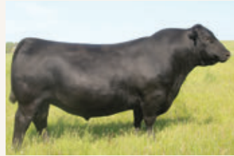
REFERENCE SIRE S A V RAINFALL 6846