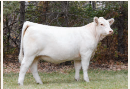
MATERNAL SISTER HIGH BLUFF JLO 53J