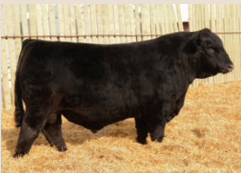
3/4 BROTHER - HIGH BLUFF KINGSTON 130K

If you're searching for a black bull that combines exceptional quality with a standout presence, look no further than High Bluff MVP. This bull is truly a one-of-a-kind individual. Even if black simmentals aren't your usual choice, taking the time to view MVP is worth it—he brings everything to the table in terms of structural integrity, power, and style. MVP is remarkably solid in his makeup. He's extremely masculine, with excellent bone structure, and moves effortlessly, showcasing his balance and fluidity. His impressive width, big top, and overall depth further highlight his impressive presence. Add to that his "look at me" charisma, and you'll quickly see why MVP is so special. His dam is a consistent producer of both top-quality bulls and females, and she has proven herself as one of the best in our herd. This calf is a direct reflection of that excellence and is truly one of the top bulls we've raised. Don't hesitate to reach out with any questions—MVP is a bull you'll want to consider adding to your operation. Retaining a ¼ semen interest for in herd use.