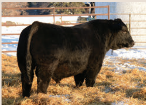
FULL BROTHER - HIGH BLUFF KINGPIN 123K