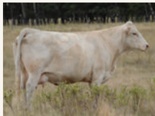
DAM HIGH BLUFF BUSTER 87B

A couple of very unique breeding pieces with Maximum Impact x Bronco mating. Outcross pedigree. A pair of bulls that get it right in terms of the fundamentals; built right from the ground up solid in foot and joint structure. These bulls are so similar in design it takes the tag to tell them apart. They are deep made, level topped and have a great disposition.