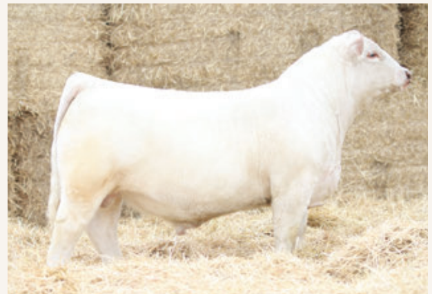
SIRE PCC INNOVATION 123J

Natassia 44E is a powerful female from a proven and productive cow family. She has a spot on production record- 7 calves in the last 7 years, each calving around the same time each year. 3 top end power females that have all been retained in the herd and are in production. 1 calf on the ground, and 2 bulls in the bull sale, 1 of which was our high selling bull in 2021.