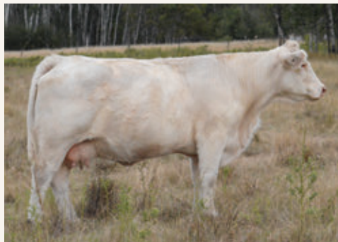
DAM HIGH BLUFF LADY SLIPPER 72F