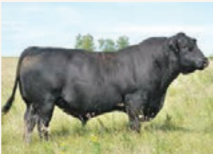
REFERENCE BAR-H MINDBENDER 141D