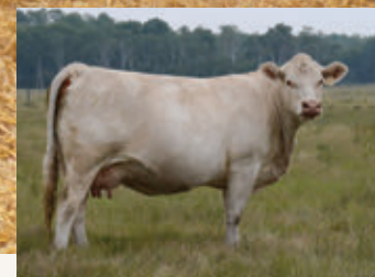
DAM HIGH BLUFF GELLIA 8D