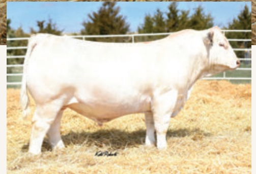
SIRE RBM KEYSTONE H41