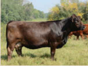
DAM EGC BLACK LASHES 36G