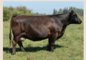
DAM EGC LASHES 4C

High Bluff Mateus is a moderate, attractive bull with a strong, masculine skull and a well-balanced, functional build. He has excellent foot structure, deep heel depth, and hair coat. His dam 4C is a moderate-sized, eye-catching, and structurally sound female with an excellent temperament. She's a prime example of our Lashes genetics, known for their longevity, fertility, and consistent performance. This year, 4C raised her 9th calf, all born in the first cycle—true testament to her reliability.