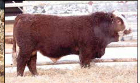
ANCHOR D CRUZ 167J SIRE OF LOTS 32 - 34