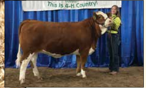
FULL SIBLING TO LOT 39