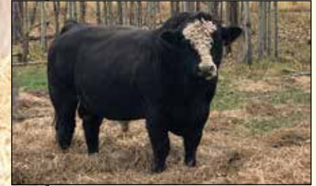
BOSS LAKE WALLBANGER 714E SIRE OF LOTS 24, 28 and 30