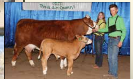
SKYWEST JANET - DAM OF LOT 34

Calving Ease Specialist right here – he comes from a long line of calving ease on both sides. He is as long as they come and smooth made. Skywest Janet & Law Breaker were awarded Grand Champion Cow/Calf at the District 4H show. Another Spartan / Radioactive grandson with proven genetics. Our Anchor D Cruz bull is a staple around here, he's perfect in the heifer pen, year after year, our heifers are on "Cruz Control" at calving. This guy is ready to go and work!