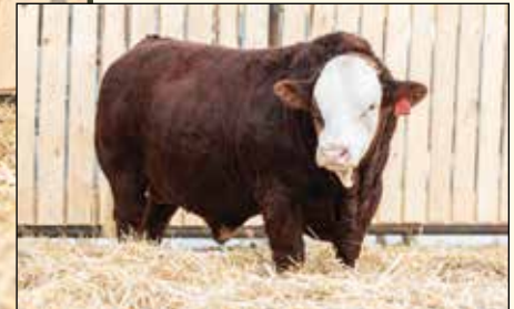
SHORTGRASS LOCOMOTIVE 253L