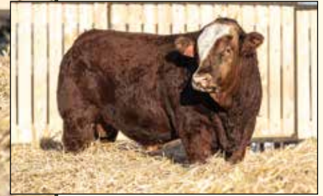
SHORTGRASS LOCK N LOAD 107L

If you're looking for your next Ranch bull, look no further. This guy has such a cowboy presence to him. He is THICK. Great muscling, thick hair coat, amazing feet and dam that you can write home about. Wolfe Hershey is backed by Brink Custer and is easily the deepest female on the farm, she is a powerhouse dam and bred to Virginia Vachon a "stuey" son, I know this 107 bull is going to go out and do great things in your herd. Talk about herd growing ability with this guy, you will want to retain every one of his daughters! You won't see a Virginia Vachon daughter leave this farm, so buy with confidence you'll be calving some herd building females, and extra pounds at weaning.