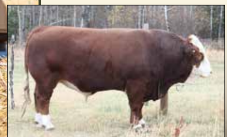
VIRGINIA VACHON 41H SIRE OF LOTS 35 - 39

Lean, Mean, Muscle Machine. Here is big time pound maker. He's as long as a freight train. With a wean weight over 1000 lbs, has us excited for his future. He comes from a large framed powerful cow, that passes on tremendous size and body depth each year. He is continually at the top at every weigh in. He is smooth made and docile as a kitten. He too made the final drive last year at the Peace Country Beef Congress at merely 10 months old. I know you're not supposed to pick favorites - but this guy just has my heart. You will see his maternal sister hit the show ring circuit this spring, and you'll know why this cow family is a favorite around here.