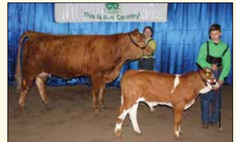
SKYWEST JANIQUA - DAM OF LOT 32