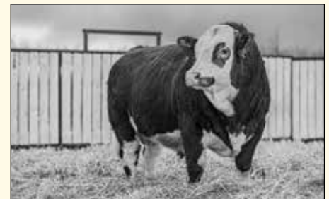
SHORTGRASS LUCKY STRIKE 120L